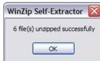
Figure 1.15 WinZip Message showing success